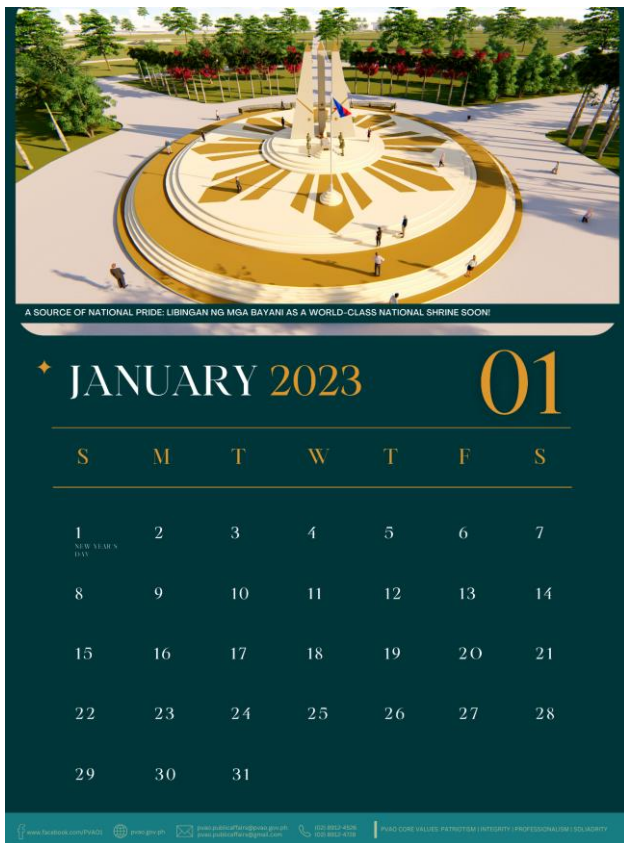
Sample design of the calendar